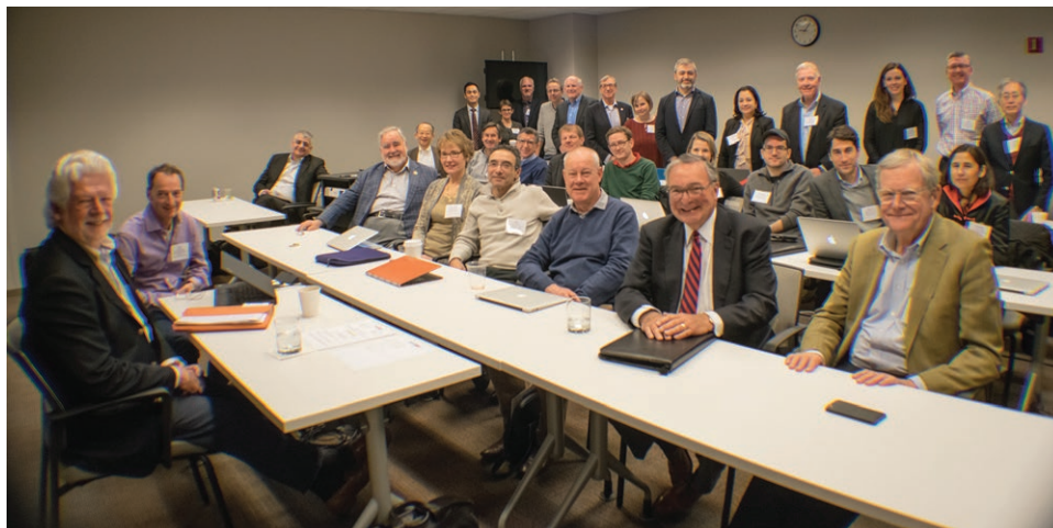
FIGURE 1 Participants of Workgroup 1